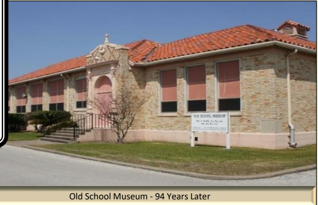
Old School Museum - 94 Years Later

WE ARE SANTA FE STRONG and SANTA FE PROUD