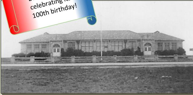
Consolidated School - Shortly After Being Built

In six years this building will be celebrating its' 100th birthday!